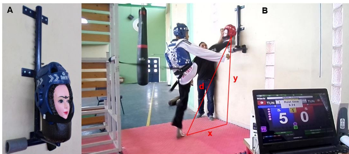
FIG. 1. A: Gen-2 E-Headgear worn by the dummy; B: TAIKT-head Protocol.

Gen-2 E-Headgear: generation-2 of the electronic headgear; TAIKT-head: Head-marking version of the Taekwondo Anaerobic Intermittent Kick Test; x : distance between the foot and the vertical projection of the contact point of the athlete's foot on the E-Headgear; y : distance of the vertical projection of the contact point of the athlete's foot; d : distance between the foot and the E-Headgear ( d = \sqrt{x^2 + y^2} ).