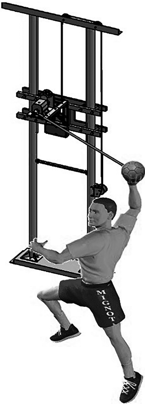
FIG. 2. 3D Illustration of the ballistic training exercise.

against loaded ball inertia, simulating a handball shot. Subjects were instructed to perform all exercises with maximal effort, totalling 312 virtual shots for each mesocycle. Recovery time between sets was three minutes [33] with arm-shoulder stretching exercises. Each session was followed by performing a throwing protocol including the three types of throw using a regular handball [28]. No injuries occurred over the 16 workouts. Participants were verbally instructed and encouraged to perform each repetition as fast as possible without receiving performance feedback.