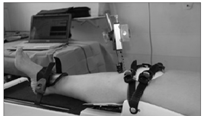
FIG. 1. Assessment of anterior tibial translation at \sim 20^\circ knee flexion.

When a participant had an ACL tear confirmed by MRI, the healthy knee was assessed first. In line with recommendations from Robert et al. [10,12], the subject lay in the decubitus dorsal position on a standard examination table with the knee at \sim 20^\circ flexion. The lower limb was placed in a single thermoformed shell adaptable to any leg length, with the hip in a free position; the arms were along the body. The knee was locked in the shell with a patellar support placed against the inferior patella margin. The ankle was fixed in a moveable boot leaving the foot free to rotate without a predefined position. The linear pusher allowed two preset levels of PL, 134 N or 250 N [5,11], on the proximo-posterior part of the calf. These forces were only applied in the sagittal plane. A displacement sensor (the accuracy given by the manufacturer is 0.1 mm; TR50 NOVO-TECHNIK, FGP Instrumentation, Garches, France) recorded the translation of the anterior tibial tuberosity from its initial position. The recorded data determined the displacement curves for each PL. The recording conditions were collected for each limb (clamping pressure to the patella, stress push). The obtained results were the displacement-load curve, the side-to-side difference in mm and the slope in \text{mm} \cdot \text{N}^{-1} [10,11].