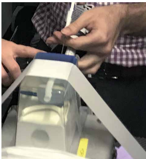
Fig. 2. Use of tissue equivalent phantom for initial prostate procedure training

“comfort level” with these procedures (as measured on a Likert scale, Table 2) was assessed prior to and following participation in these procedures. “Comfort level” was graded on a scale of 0-3, with 0 corresponding to the resident having no comfort at all with the procedure, to 3 corresponding to the resident being comfortable with performing the procedure completely independently. Trainees were also asked how many procedures they felt (in their opinion) they would need to perform to reach independent competency. Statistical comparisons were