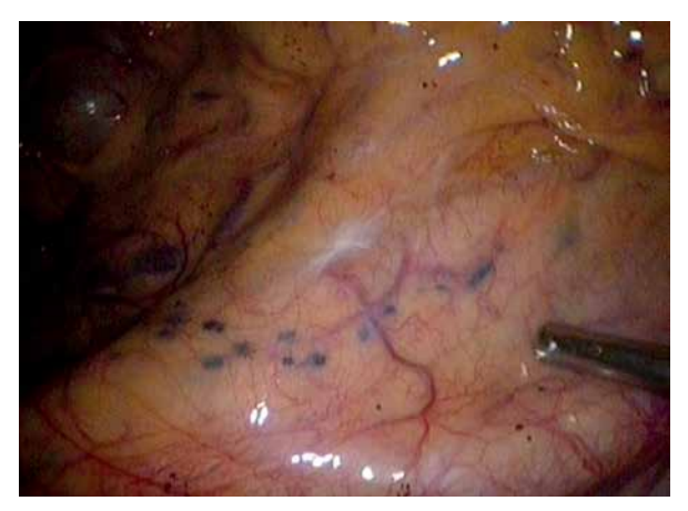
Photo 2. Intraoperative image of black-stained lymph nodes showing clear boundaries and well-defined distribution patterns along the IMA

General anesthesia was performed on each patient in the modified lithotomy position. Lymph node dissection was made via a medial-to-lateral approach along the IMA. For the LA group, radical peri-IMA lymph node dissection was completed under laparoscopy, the LCA was identified and preserved while low ligation of the IMA (the superior hemorrhoidal artery) was performed. Then, an auxiliary incision was made at the lower abdomen to remove the lesion, after which, anastomosis of the colon was performed. For the NOSES group, at first, the root of the IMA was exposed to observe the distribution of black-stained lymph nodes along the IMA (Photo 2); an incision was made to open the peritoneum at the root of the IMA in connection to the abdominal aorta; based on the tissue with black-