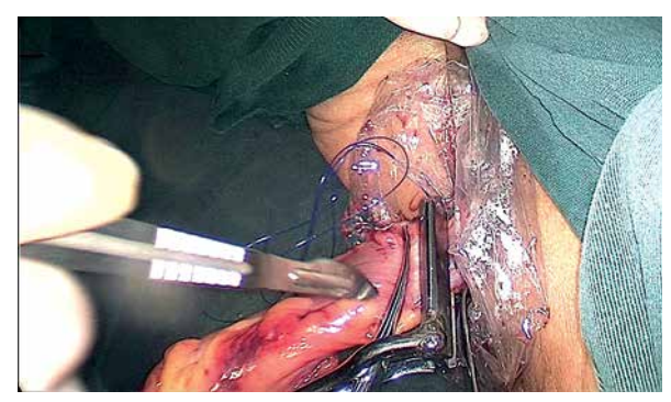
Photo 7. After abdominal lymph node dissection by laparoscope, and then the specimens were resected in vitro

and maintaining unobstructed drainage until improvement and extubation. No NOSES-associated complications, such as damage to the distal colon, bladder or anus, tumor overflow, anastomotic leakage, and intra-abdominal infection, were reported. The LA group had 6 cases of postoperative complications, including anastomotic leakage, wound infection, intestinal obstruction, and lymphatic leakage. Two patients with anastomotic leaks were given transverse colostomy and conservative treatment, respectively. The wound infection, intestinal