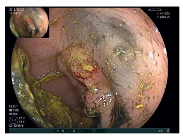
Photo 1. Carbon nanoparticle suspension was injected at a distance of about 0.5 cm from the lower edge of the tumor for labeling and tracing the day before surgery