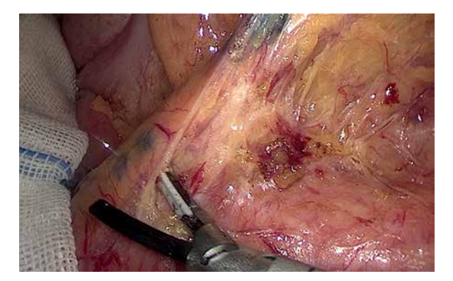
Photo 3. Lymph node dissection guided by black-stained lymph nodes surrounding the IMA

After lymph node dissection, the superior rectal artery (SRA) was cut under the IMA-LCA junction (Photo 5). Determination of resection lines was subject to the labeled lymph nodes. In the case of colon cancer, the margins of resection on both sides should be 10 cm or above; in contrast, a distal margin of resection of at least 2 cm should be obtained below the edge of the rectal cancer; splenic flexure mobilization is not recommended in either case. All specimens were then removed through the anus. Tumor location is the most important factor in the selection of different surgical procedures. High rec-