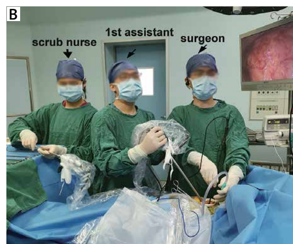
Photo 2. A – The patient was adjusted to an approximately 45° semi-supine position by rolling the operating table. B – The operating room setup and positions of the surgeon and the first assistant for resection of the mediastinal lesion