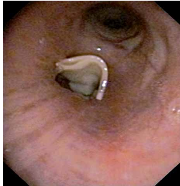
Photo 1. Proximal part with the falling petal valve of the rubber endobronchial prosthesis is seen, while its distal cylindrical part is implanted in the affected upper segment of the left lower lobe (patient 10)

Palmen et al. [8] showed that VAC treatment of recurrent empyema in the presence of the residual lung tissue with or without alveolopleural fistula achieved spontaneous OWT closure through the acceleration of tissue granulation. There was such