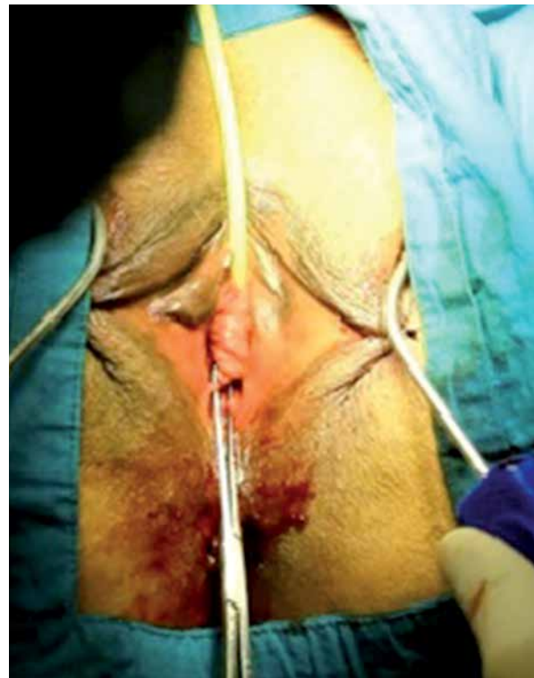
Photo 4. A 0.5 cm cut is made, and needle points are taken outside