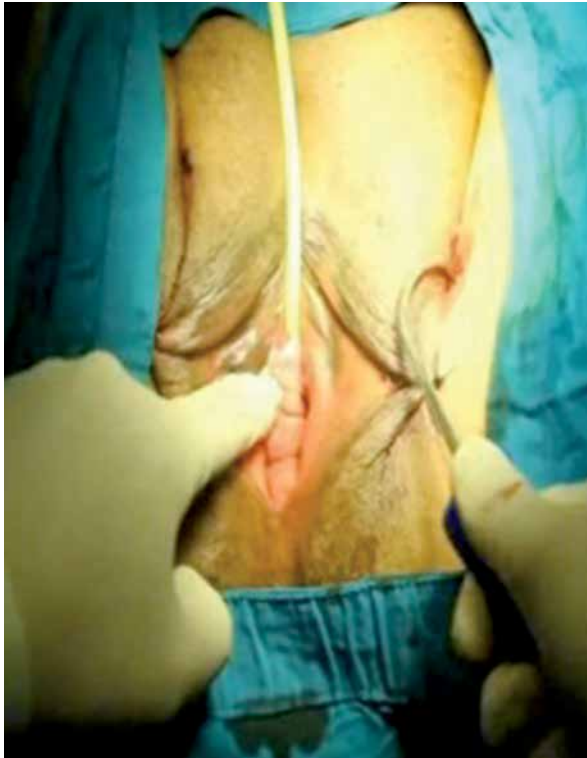
Photo 1. The needle is pushed until it reaches 1.5 cm below the urethral meatus (left)