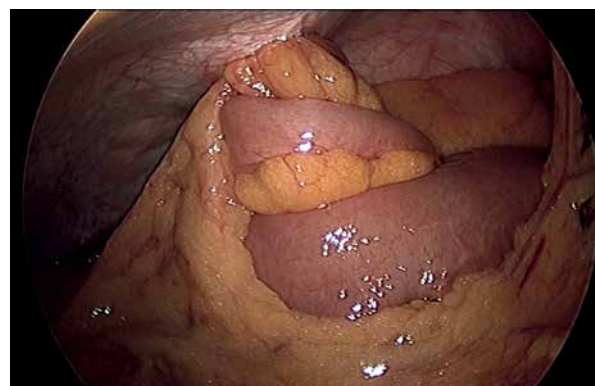
Photo 2. Laparoscopic picture showing a small bowel loop twisted and herniated through the left 8-mm port site