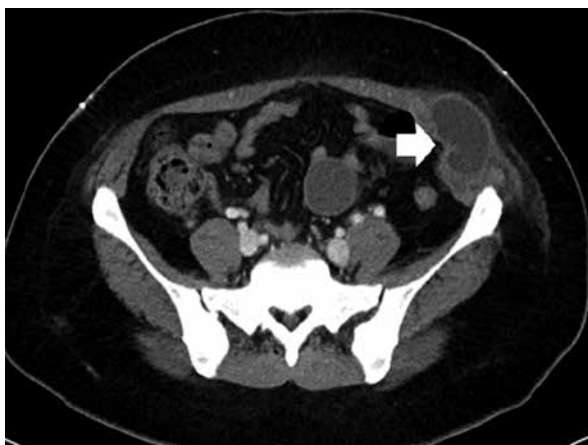
Photo 1. Arrow on the abdominal computed tomography image showing a loop of the small bowel herniating through a defect of fascial and peritoneal layers at the left 8-mm port site

lower quadrants) [1]. The operative time was 75 min, with no drainage or intraoperative complications. After the specimen was retrieved from the mid-lower incision site, no fascial closure was performed. The patient was discharged 2 days postoperatively, after an uneventful recovery. Later on the day of discharge,