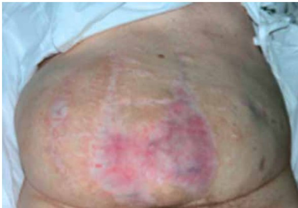
Photo 1. Recurrent hernia after laparotomy and the primary suture repair complicated by wound infection