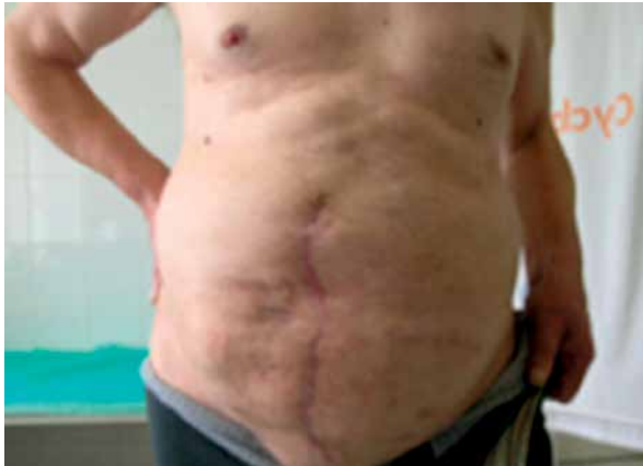
Photo 3. Postoperative appearance 6 months after the hybrid repair

batack). The total operative time ranged from 100 to 180 min.