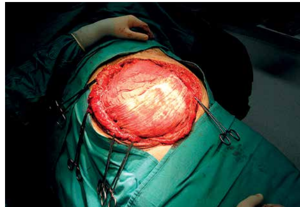
Photo 2. Open part of the operation. Perioperative view after removing large scar

repairs of hernias. In this group there was 1 patient with a body mass index above 31 kg/m 2 , referred to our department from the emergency unit with symptoms suggesting intestinal occlusion. Three patients had recurrent hernia after appendectomy complicated by wound infection and open repair of the hernia afterwards. One patient had a huge hernia after numerous laparotomies (cholecystectomy, hysterectomy, appendectomy, peptic ulcer perforation), and 1 patient after open repair of hernia after appendectomy, laparoscopic intraperitoneal onlay mesh (IPOM) repair of recurrent hernia complicated by haemorrhagic shock requiring removal of the mesh during urgent relaparotomy afterwards.