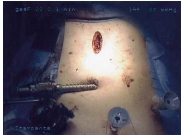
Photo 2. Laparoscopic access 10-mm laparoscope in the standard umbilical position, three 5-mm trocars in suprapubic, left iliac fossa and in the upper right quadrant of the abdomen, one 12-mm trocar in the right iliac fossa and longitudinal supra-umbilical mini-laparotomy

Forty-two days after surgery, DCBE confirmed that all three anastomoses were intact and ileostomy was converted by an end-to-end stapled anastomosis (Photo 3). Concurrently a laparoscopic second look was performed, showing a recurrent modest amount (250 ml) of ascites and a decrease in the Glisson's capsule inflammation. At 48 months of follow-up, the patient was asymptomatic and no significant pelvic effusion was observed at ultrasound examination. All biochemical markers were normal; liver enzymes were not altered and no signs of malabsorption were observed.