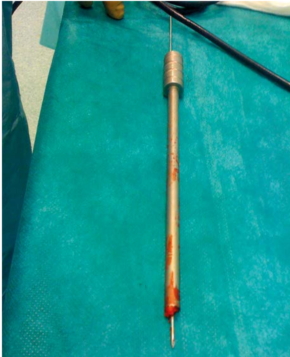
Photo 2. The bone cutter removed with the guiding K-wire and resected part of the facet. Note K-wire is centralized in relation to bone cutter