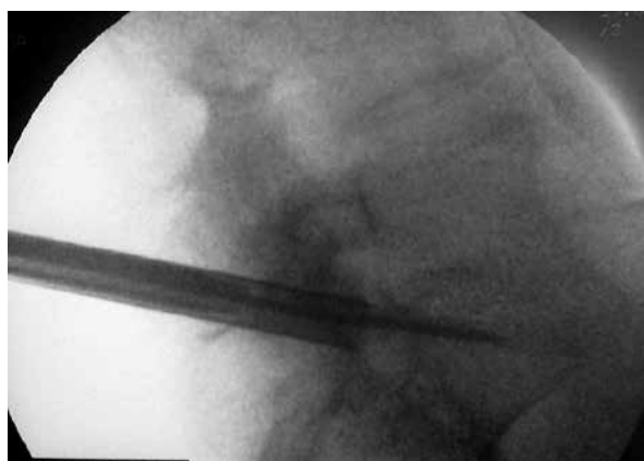
Photo 1. Lateral view of the guide K-wire with obturators centralizing the bone cutter entering the L5/S1 intervertebral space

The approach trajectory was drawn to enter the center of the L5/S1 intervertebral disc on both anteroposterior (AP) and lateral plane. According to this guideline, the skin entry point was approximately 9–10 cm aside from the midline as close as possible to the iliac crest under AP view, just to slide over its rim. Under fluoroscopic guidance, a long 2 mm K-wire was inserted, after skin incision. The K-wire was aiming at the lateral aspect of the L5/S1 facet joint on the affected side and projected through the