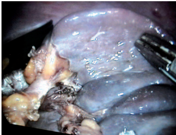
Photo 1. Proximal splenorenal ligament left intact