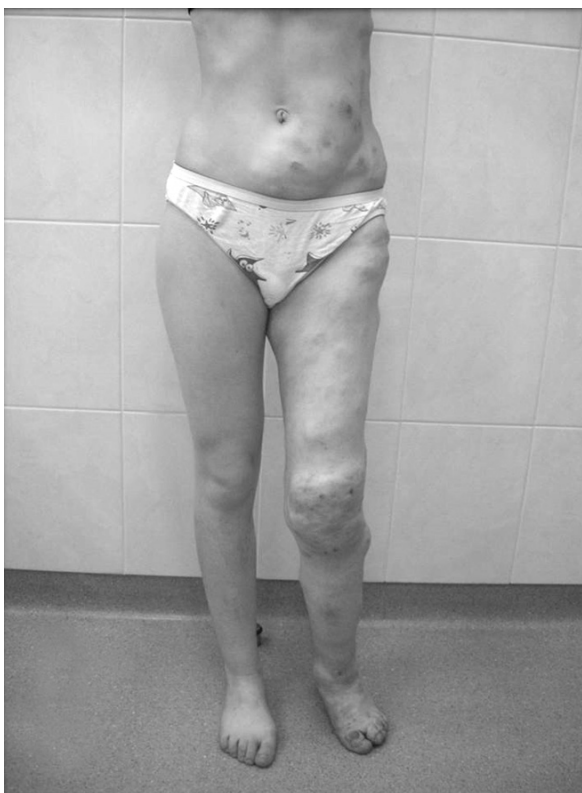
Figure 1. Venous malformation — external appearance

On the day preceding the procedure, the patient underwent standard preoperative assessment and was scheduled for general anaesthesia. Her history and information from the questionnaire that the parent completed did not reveal any medical problems apart from the underlying disease. Likewise, the family history was insignificant. In the past, the girl underwent several procedures under short-term intravenous general anaesthesia without intubation and these were uneventful; the only exception was arthroscopy performed in another hospital, which