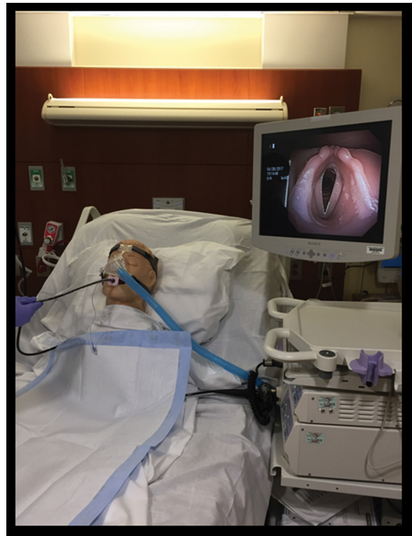
Figure 2. Demonstration of the concept of awake bronchoscopic intubation supported with continuous nasal positive pressure ventilation

Airway management plans can be more complex with the application of NIV and require additional experience with a defined protocol. The equipment costs include the use of the ventilator, the disposable airway interface, ventilator tubing, and the personnel to set up the equipment. Adding unfamiliar equipment and procedures can distract clinicians during emergency airway management. Using