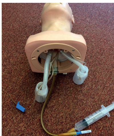
FIGURE 2. Experimental setup of the manikin